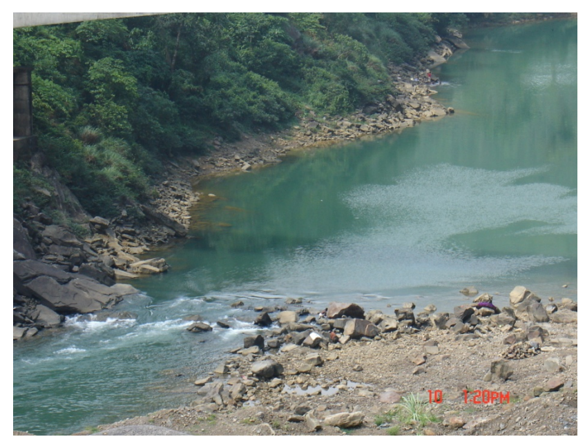
Photo-4: Narrowing of Lubha river channel by accumulation of slide debris