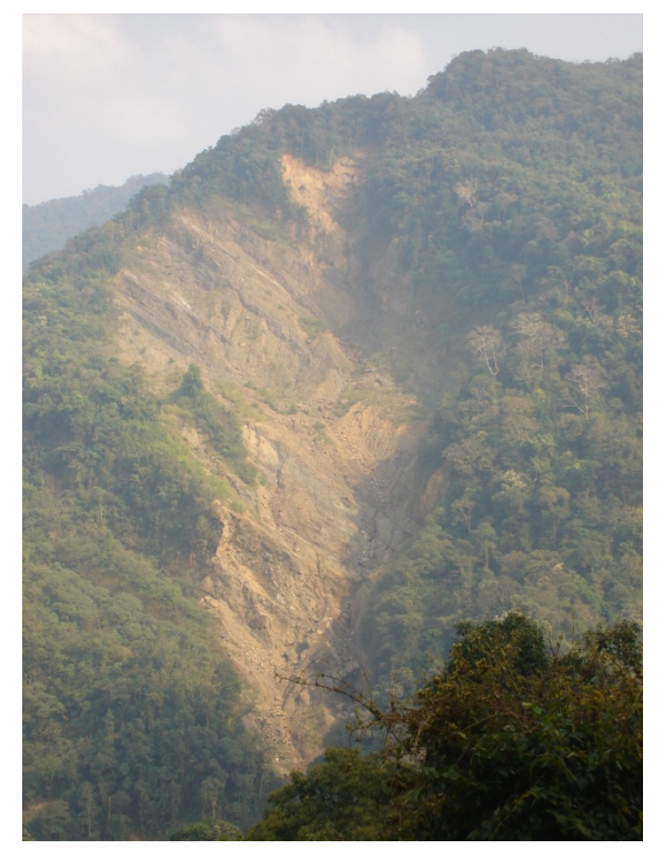
Photo-1: View of Sonapur landslide, Jaintia Hills district, Meghalaya